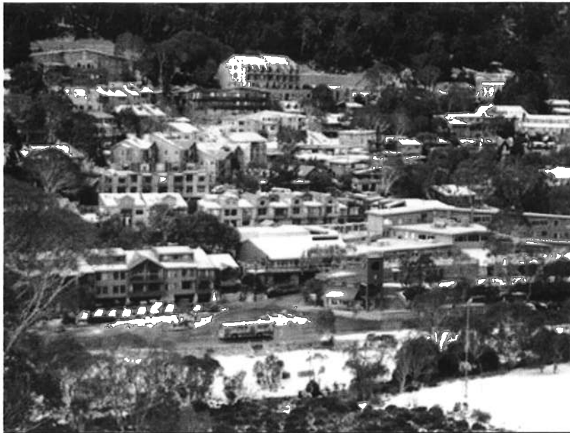
Figure 4: View towards Thredbo village.