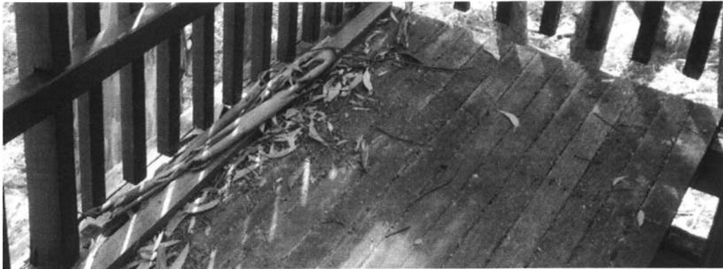
Figure 10: Existing deck.