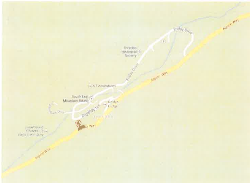
Figure 1: Locality map

Athol Lodge (Lot 56, DP 1119757), is located at 7 Diggings Terrace, Thredbo, NSW. Thredbo is a small village situated within Kosciuszko National Park that primarily functions as a ski resort.