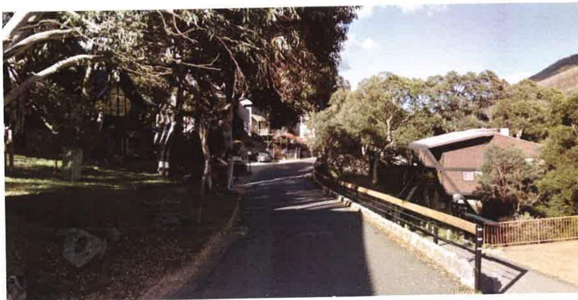
Figure 8: Streetscape and front facade of Athol Lodge (on the left side of the photograph).