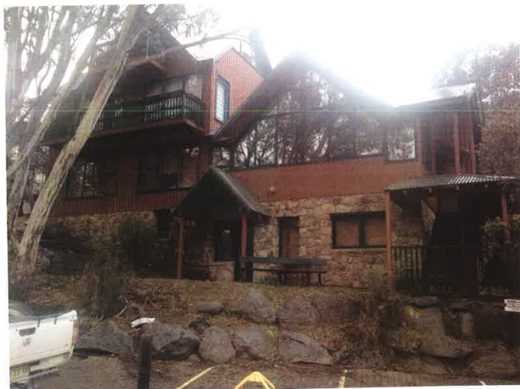
Figure 7: Front facade of Athol Lodge.