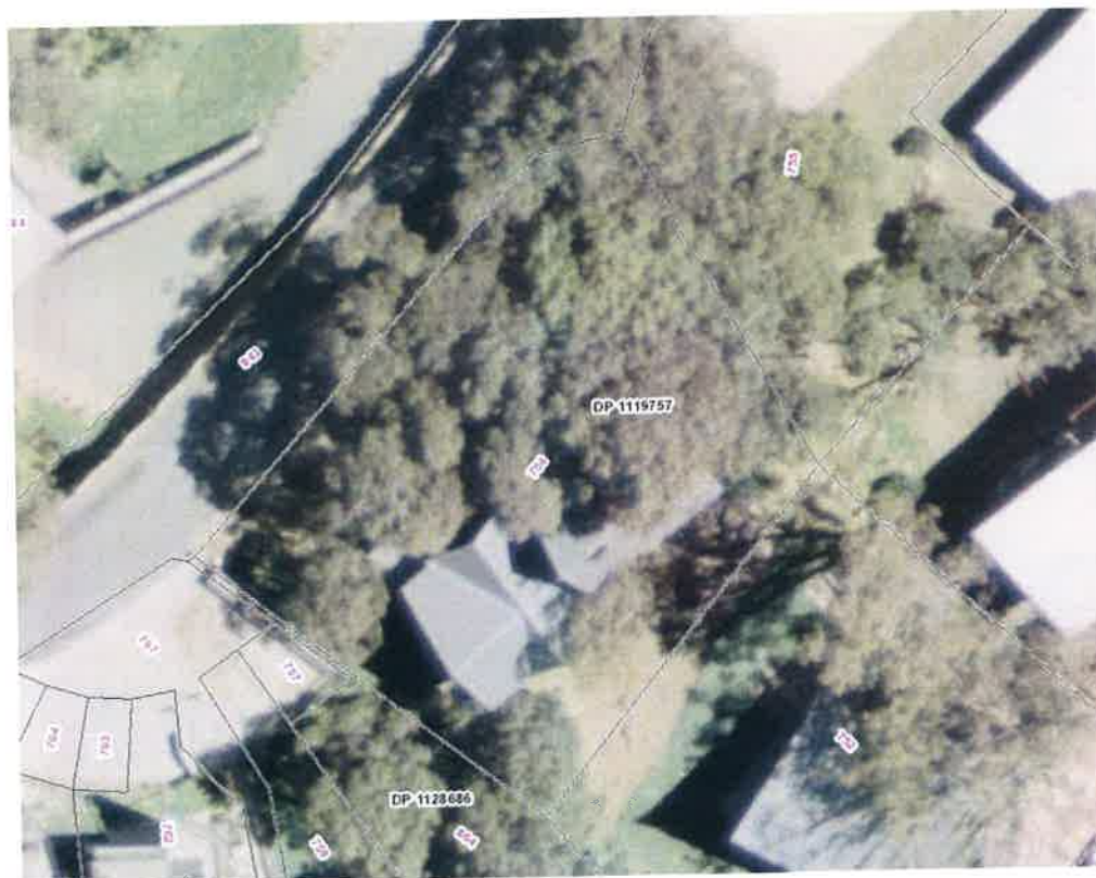
Figure 6: Aerial view of Athol Lodge showing the roof.