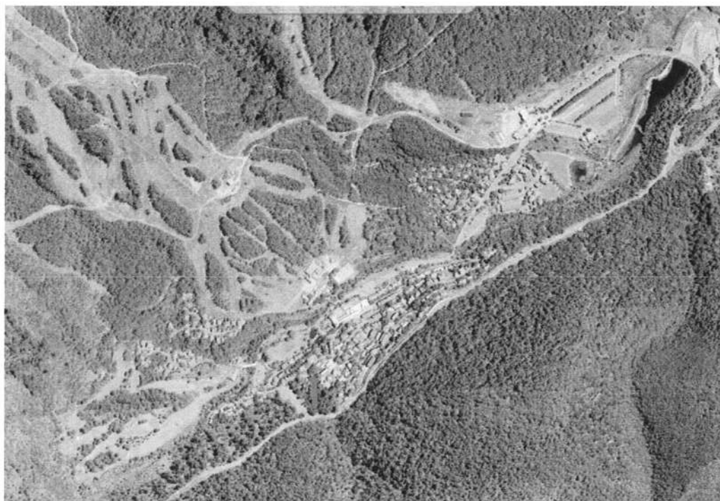
Figure 3: Aerial view of Thredbo Village. The location of Athol Lodge is indicated with a red arrow.