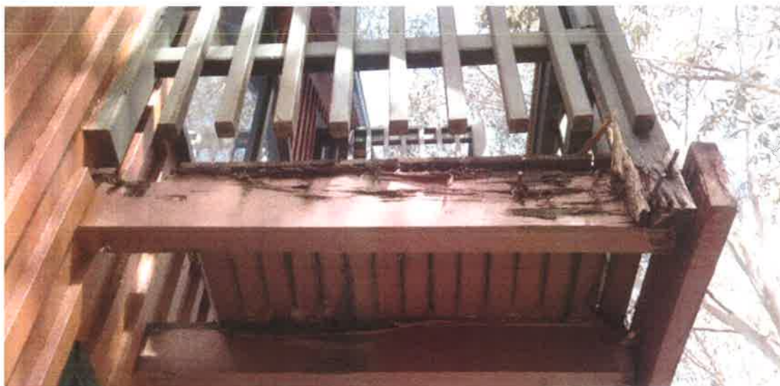
Figure 9: Existing deck.

The structural inspection report dated 23 April 2013 and prepared by G.O. Engineering Consultants states that the balcony of the main building is no longer structurally sound and that the existing decking is inadequate. The report recommends remedial action.